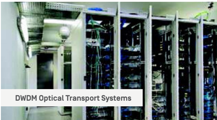
DWDM Optical Transport Systems

Qnnect is the premier global supplier of hermetic packaging, components and services to leading manufacturers in the optical networking industry. Comprised of highly respected microelectronic packaging brands - Hi-Rel Group, Litron, PA&E and Sinclair Manufacturing, we offer a single source of supply for hermetic packages, connectors, headers, lids, windows, thermal management materials, vacuum products, preforms and laser solutions. We make our customers lives easier by providing a comprehensive solution to enable and protect sensitive electronics in harsh environments.